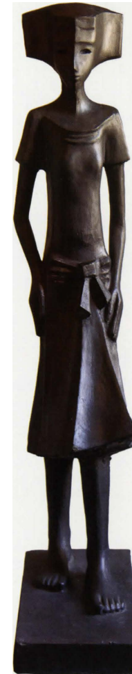
Ahmed Abdel Wahab Egyptian Girl , 2006 Artificial stone 103 x 20 x 35 cm

His work is included in private collections in Egypt, Italy, the United States, France and the Netherlands, as well as in museums across Egypt, and at the Museum of Modern Art in Prague, Czech Republic.