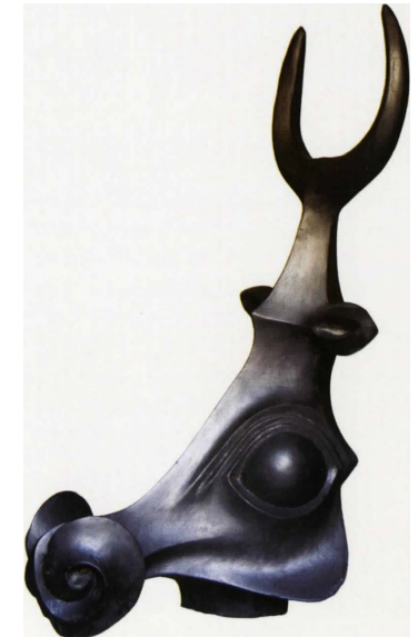
Ahmed Abdel Wahab Bull , 1975 Artificial stone 118 x 80 x 53 cm